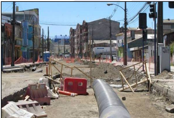
Street and utility reconstruction in Talcahuano city center is evident throughout the low-lying areas of this community.

Most of Chile's central coast communities were affected by tsunamis that followed the February earthquake. In Talcahuano, a bayside community located directly north of Concepción, town center buildings housing important municipal and community operations were still in the midst of cleanup and repair from water and ground-shaking damage. Many streets were blocked off for reconstruction of pavement and underground utilities, as pre-Christmas street commerce was attempting to cope at the time of our visit. A new school (replacing a damaged and flooded waterfront campus) was due to open on an elevated site, just in time for the new school year which begins in March in Chile. Before the earthquake, Isla Rocuant's industrial zone housed an enclave of thriving fish processing plants. In December, post-tsunami cleanup continued and only a few plants were operating. The local fishing fleet looked depleted. On the other hand, the container shipping business at the nearby port of San Vicente appeared to have recovered.