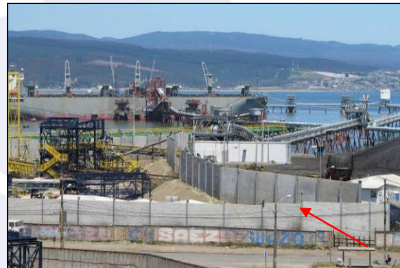
Low-lying areas of Port of Coronel (south of Concepción) are surrounded by newly constructed flood walls.