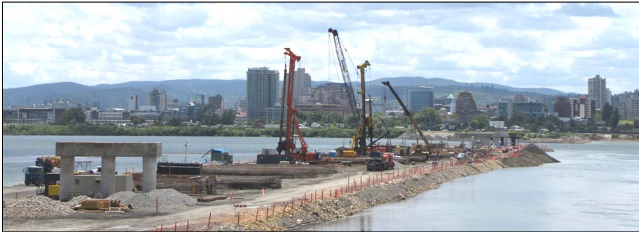
December 2010: Construction is in progress on a new highway bridge over the Bío-Bío River in Concepción. This crossing will replace a bridge damaged by the earthquake. The city skyline (background) includes a number of vacant residential towers.

The M8.8 Maule earthquake of February 2010 impacted much of central Chile and resulted in over US$30 billion in economic losses. As previously reported by MRP Engineering, this subduction zone event provided many important lessons in seismic performance of modern buildings, industrial structures, as well as infrastructure (additional information can be found at www.mrpengineering.com ). MRP Engineering returned to Chile (Concepción area) in December 2010 to observe successes and challenges in rebuilding the region. As discussed in the following paragraphs, although nearly a year has passed since the mega-earthquake, this event continues to provide valuable insight on recovery and reconstruction issues.