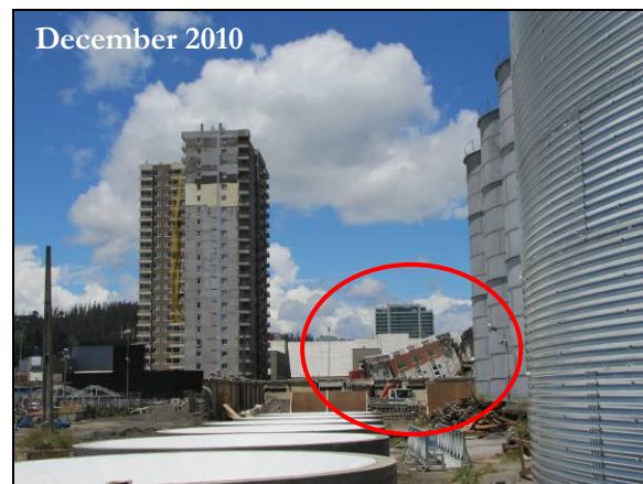
Concepción City Center: Collapsed grain bins have been removed but not yet replaced as shown in these two images taken in March and December of 2010. The 20-story residential tower in the background remains vacant. The right photograph includes the toppled Rio Alto tower (in the circle) which is still under investigation.