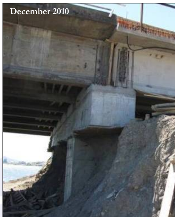
The photo on the left shows Juan Pablo II Bridge fractured column caused by soil liquefaction and lateral spreading along the Bío-Bío riverbank. The photo on the right depicts the new bridge girder and columns.