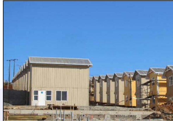
Fast-track community of wood-framed housing for residents displaced by tsunamis

Bío-Bío River (Chile's longest) bisects Chile as it flows from the Andes and empties into the Pacific Ocean near Concepción. Functioning river crossings (highway and rail) are of vital regional economic importance. The reconstruction of Concepción's highway bridges represents one of the success stories in the aftermath of the February earthquake. The Juan Pablo II Bridge, a two-kilometer-long four-lane highway crossing, sustained major damage to its foundations and columns due to soil liquefaction. This bridge was re-opened to traffic in October. Regional transportation system repairs are evident throughout the area as work continues on stabilizing bridge embankments and slopes along roadways.