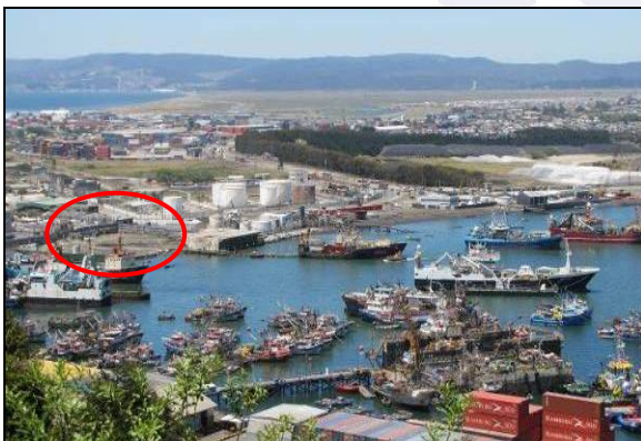
San Vicente Bay's industrial zone is recovering. A fish-processing plant (circled area) has been demolished.