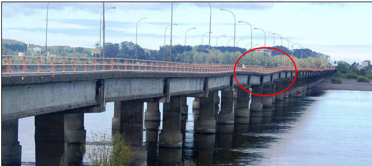
Juan Pablo II Bridge damaged in the February earthquake was restored to service in October 2010. This photo from March 2010 illustrates some of the bridge foundation damage as evidenced by the sagging roadway.

Bío-Bío River (Chile's longest) bisects Chile as it flows from the Andes and empties into the Pacific Ocean near Concepción. Functioning river crossings (highway and rail) are of vital regional economic importance. The reconstruction of Concepción's highway bridges represents one of the success stories in the aftermath of the February earthquake. The Juan Pablo II Bridge, a two-kilometer-long four-lane highway crossing, sustained major damage to its foundations and columns due to soil liquefaction. This bridge was re-opened to traffic in October. Regional transportation system repairs are evident throughout the area as work continues on stabilizing bridge embankments and slopes along roadways.